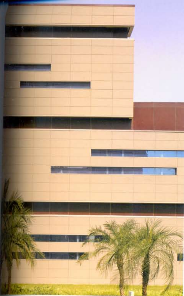
Shaded outer façade with small slit windows