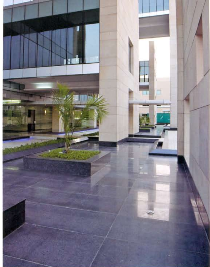
Informal breakout spaces