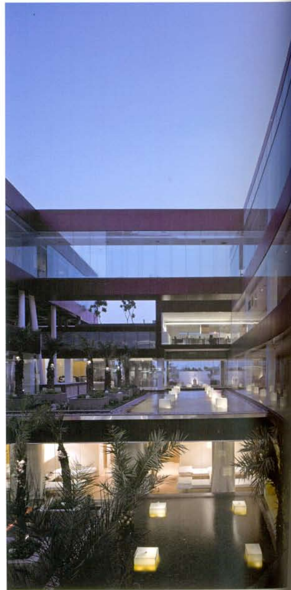
Night view of the inner courtyard

As is the nature of most bespoke corporate developments, the building had to exemplify the brand identity and corporate ideology of equity and transparency in the workplace as an integral part of the architectural vocabulary. Conceived as a solid perimeter scheme with a more fluid interior, the morphology blurs the interface between the inside and outside. The built form optimises the natural day lighting and helps to define the programmatic requirements of the office. A stacking system is used to generate a variety of open spaces, such as courtyards, verandahs and terraces, which help to structure the office spaces. A central spine traversing the built volume serves as the common activity zone, with other departments branching out. The design's conceptual strength comes from the spatial organisation which creates overlaps between the exterior and the interior and between the various programmatic requirements, hence creating a vibrant and creative work environment.