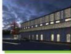
Qutab Colonnade, New Delhi Delhi Art Gallery, Mumbai British Council Library, New Delhi