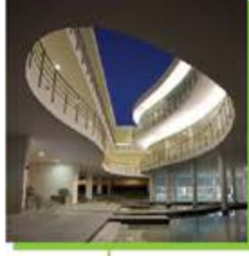
Jubilant R&D Centres, Noida