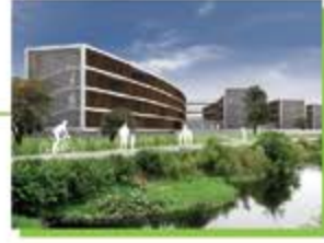
The Heritage School, Faridabad