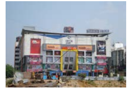
Jaipur today - An architecture that is unsympathetic to its context.

Throughout the day, students spill out from classes, the library and cafeteria onto the walkways and down to the shady underbelly of the building. Cooler air is drawn into this space and steps lead down to a shallow pool of water recycled from the sewage treatment plant and augmented by rain, which functions as a thermal sink. As temperature drops through the night, water dissipates the heat accumulated during the day. Even in summer, this protected courtyard is an inviting place to gather- for a performance, an exhibition, an alfresco lunch, or a casual encounter with friends.