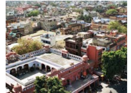
City's traditional built fabric that developed over centuries of trial and error