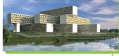
Campus for Infosys Ltd, Nagpur