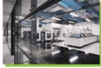
Pearl Academy of Fashion, Jaipur