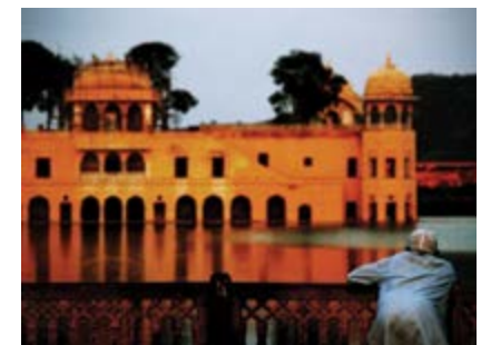
Traditional architecture of Jaipur