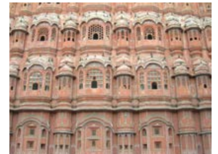
Hawa Mahal in Jaipur - Passive design integrated with architecture