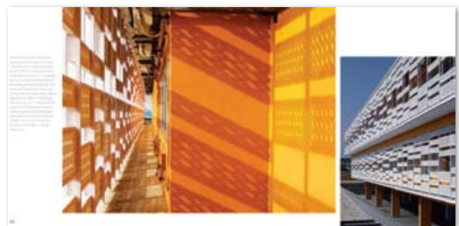
The outer skin sits 4 ft away from the building and reduces direct heat gain.