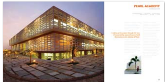
Exterior façade of the Pearl Academy, Jaipur.