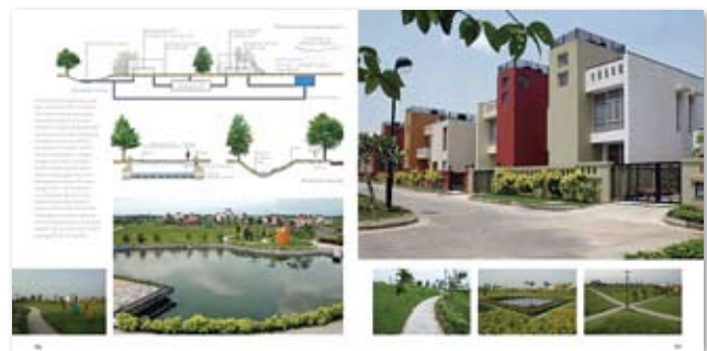
Uttarayan Township in Siliguri comprises high-quality infrastructure of each cluster of 20 plots, structured around communal greens and water bodies.