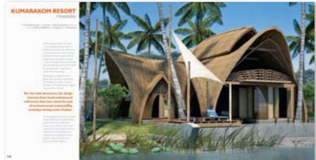
Kumarakom Resort, Kerala.