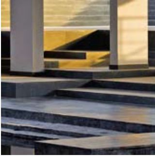
Cover graphics: collaboration between Nicole Boehringer (Images Publishing) and Natasha Suri (Morphogenesis).

maximum precipitation levels (three metres rainfall annually) and affordability (tier 2 price point). The self-contained township sets an example by being self-sustainable, ecologically and economically viable, and culturally and socially in harmony with its context – all factors still quite exceptional by Indian standards.