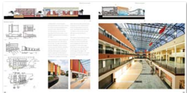
Positioned in the interface between the city and the township, City Centre creates a much-needed, organised commercial district for Siliguri.