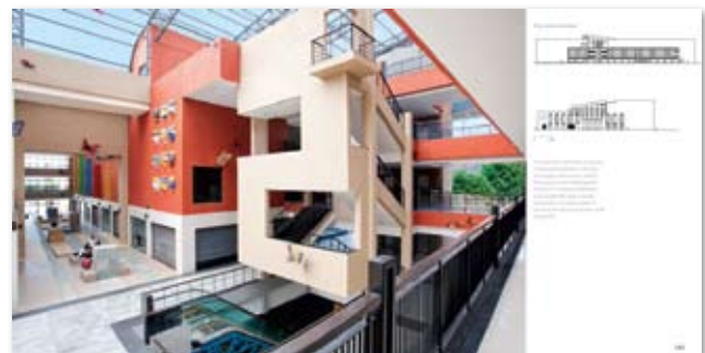
Uttarayan's City Centre is one of the largest commercial developments in Eastern India.