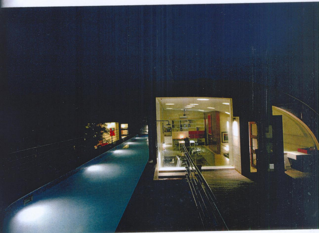
Top: Lap pool and alfresco dining on the second floor.

Descending steps cascade to subterranean offices or rooms and furniture framed by large picture windows. The ceiling of the central space is dotted by circular skylights over an interior garden. A lap-pool fed by harvested rain water runs the length of the terrace on the second floor.