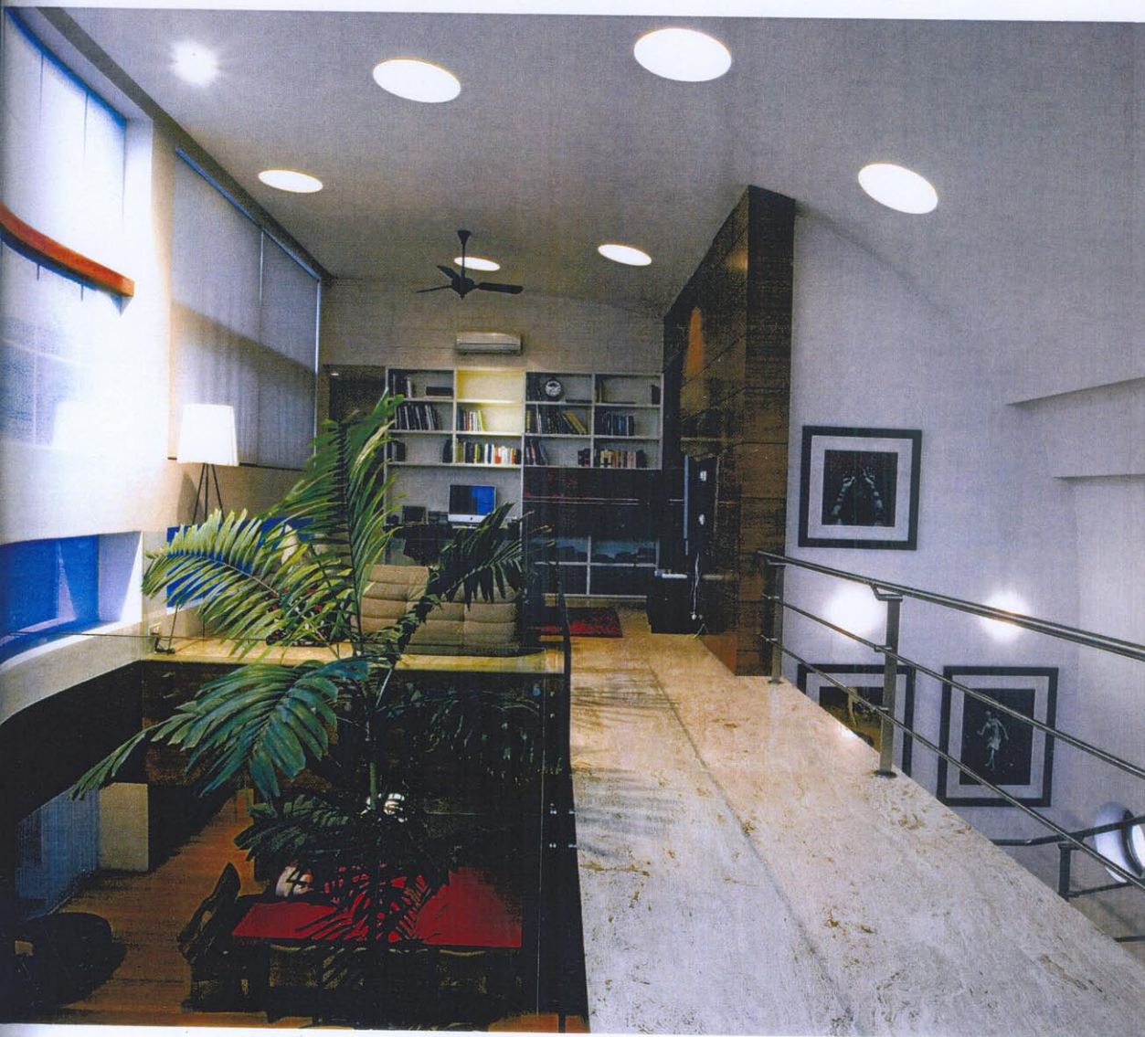
Top: The vaulted roof on the west face.