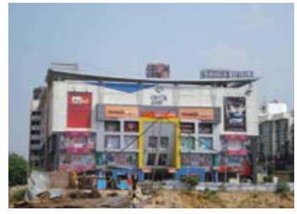
Jaipur today - An architecture that is unsympathetic to its context.

Throughout the day, students spill out from classes, the library and cafeteria onto the walkways and down to the shady underbelly of the building. Cooler air is drawn into this space and steps lead down to a shallow pool of water recycled from the sewage treatment plant and augmented by rain, which functions as a thermal sink. As temperature drops through the night, water dissipates the heat accumulated during the day. Even in summer, this protected courtyard is an inviting place to gather- for a performance, an exhibition, an alfresco lunch, or a casual encounter with friends.