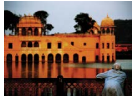
Traditional architecture of Jaipur