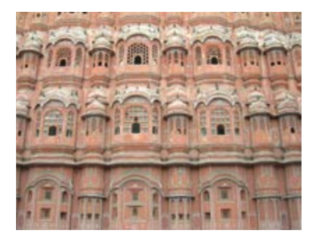
Hawa Mahal in Jaipur - Passive design integrated with architecture