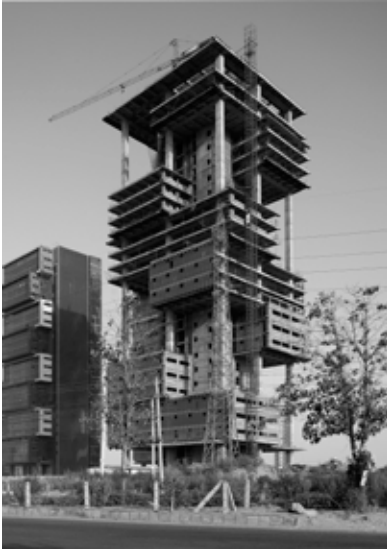
GYS VISION TOWERS, GURGAON