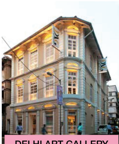
DELHI ART GALLERY