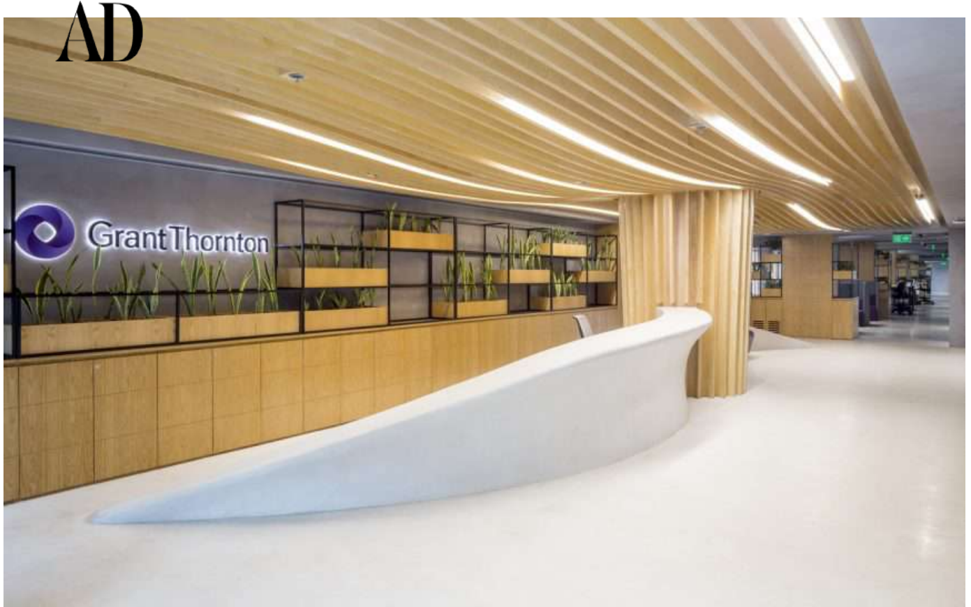
Open plan, muted hues and tactile materials highlight this office