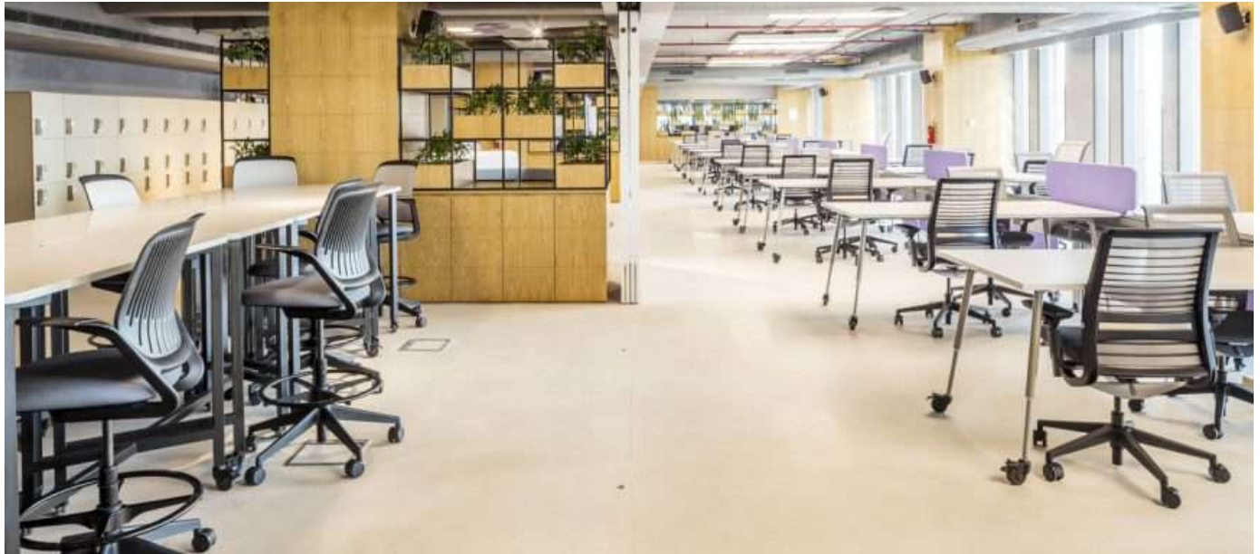
A contrasting palette of warm and cold materials are used to complement the shades of greys, purples and blues

To create a healthy work environment, the spaces have been designed with hives for work desks, jump spaces for discussions and meetings, training rooms, leadership and operations area and an outdoor area that acts as a recreation as well as a work floor. Wood furniture comes together to create a lively environment. “Grant Thornton has been designed as an office of the future, where the design resonates with the new order of working norms,” adds Rastogi.