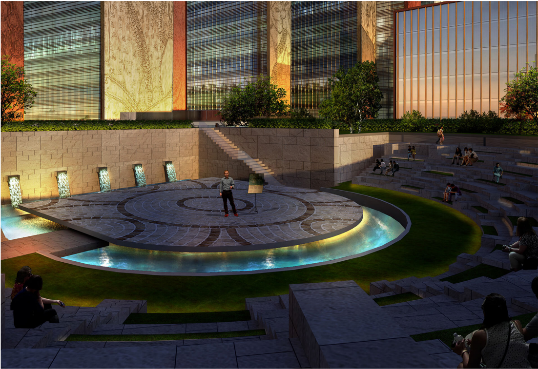
Public spaces evoke images of traditional pandals

Placemaking principles have been employed in the urban space , which will host and rejoice the Bengali socio-cultural ethos of discourse, deliberation and celebration. Evoking images of the traditional pandals (temporary pavilions) that dot the city during festivals, the public spaces have similarly been scattered along the central spine to serve as open-air museums with sculptures and art installations giving it a sense of character.