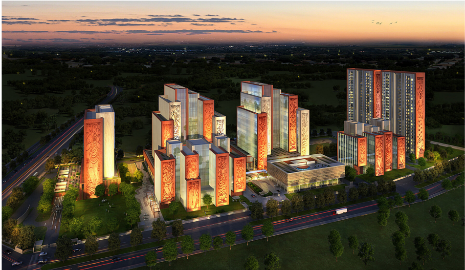
The mixed land use building features residential towers, commercial offices, a hotel and convention centre

A series of residential towers, IT and commercial offices, a hotel and a convention centre that together compose the ITC Campus is set to spring up in Rajarhat, Kolkata, India, with construction underway. Headquartered in Delhi , architecture studio Morphogenesis inculcated the cultural pride and philosophical inclination of the citizens to create an identity for the 17-acre campus that is rooted in its rich culture.