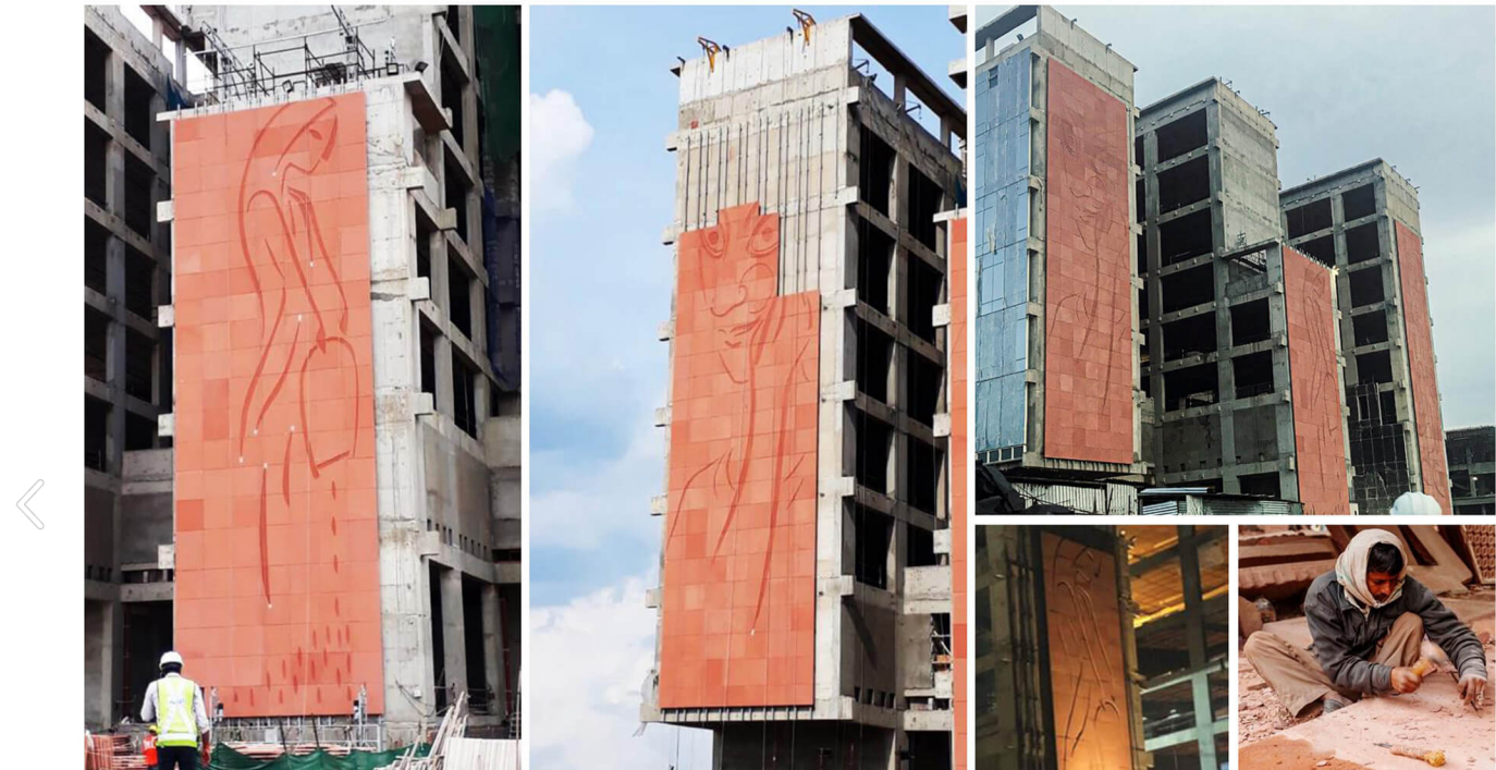
The stone façades are covered in carved murals

The vibrant artistic and artisanal culture of Bengal intimately brings the mixed-use buildings together by reflecting the region's literary heritage, music, fine arts, drama and cinema directly on the surfaces of structures. The urban stone frontages on the east and the west of the buildings present themselves as vertical canvasses decorated with intricately carved murals of the Bengal School tradition of art and craft. The intricate Bengali script and Tagore's writings on the façades inspire the crafted stone face of the lower scale convention centre in proximity.